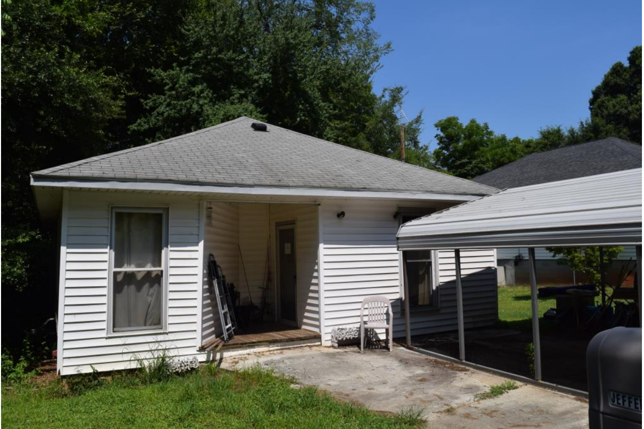
200-A Rankin St