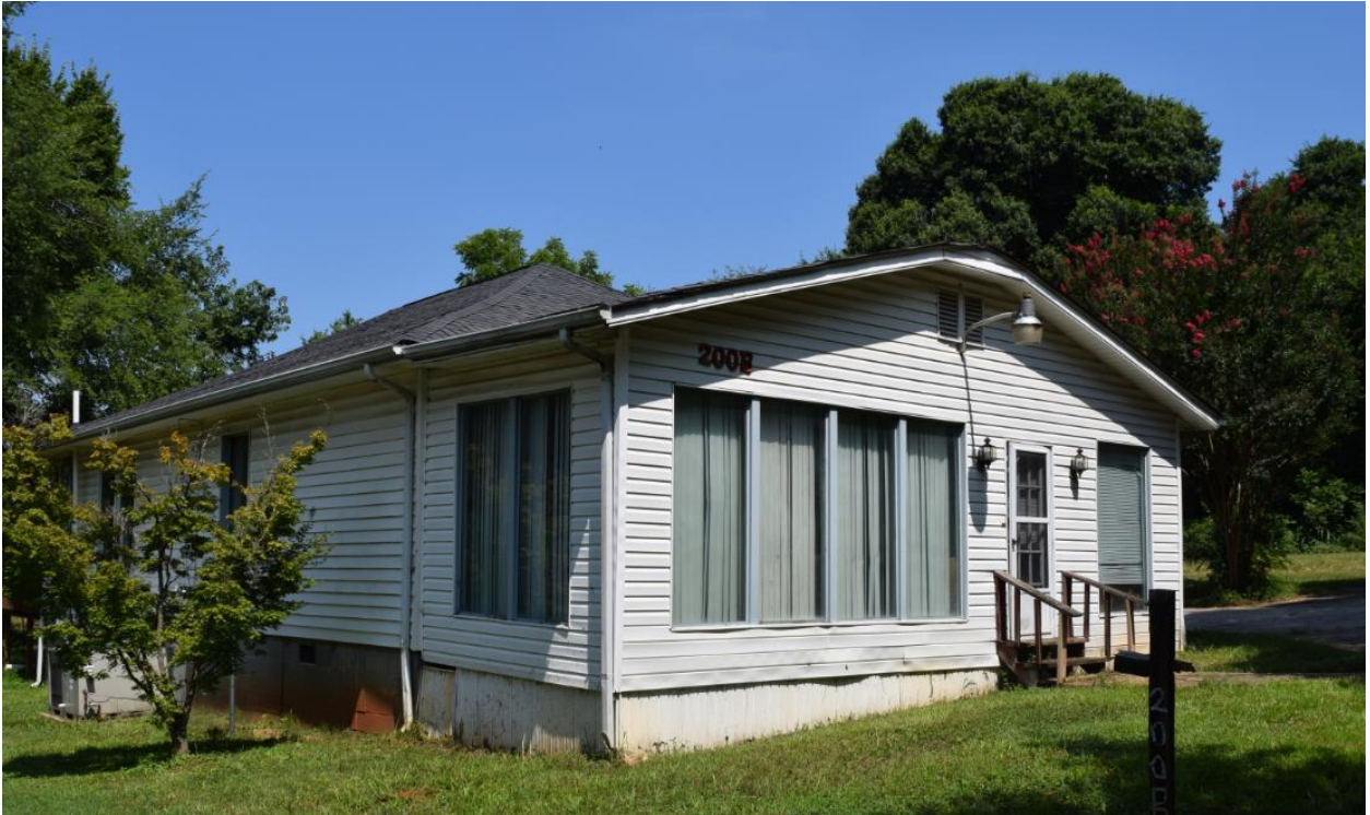
200-B Rankin St