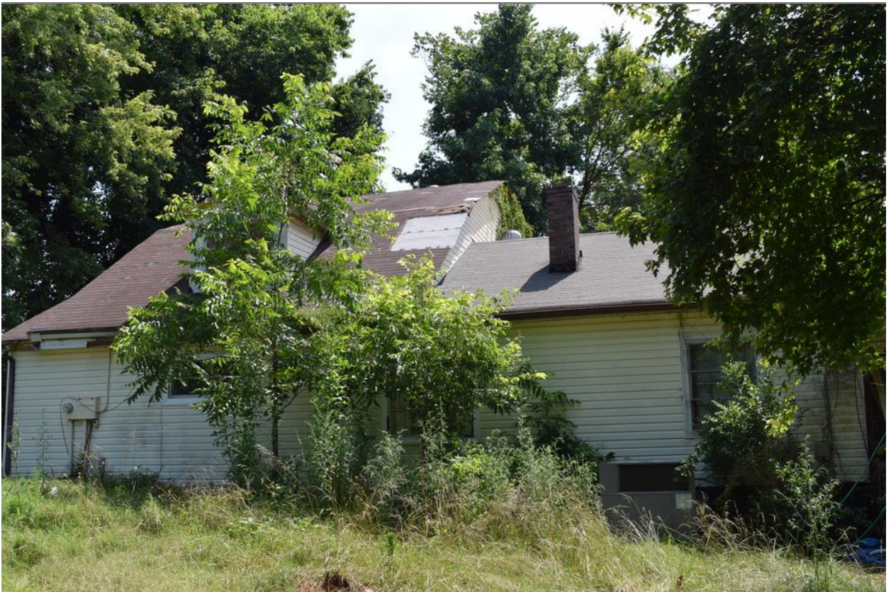
200 Rankin St Rear Addition