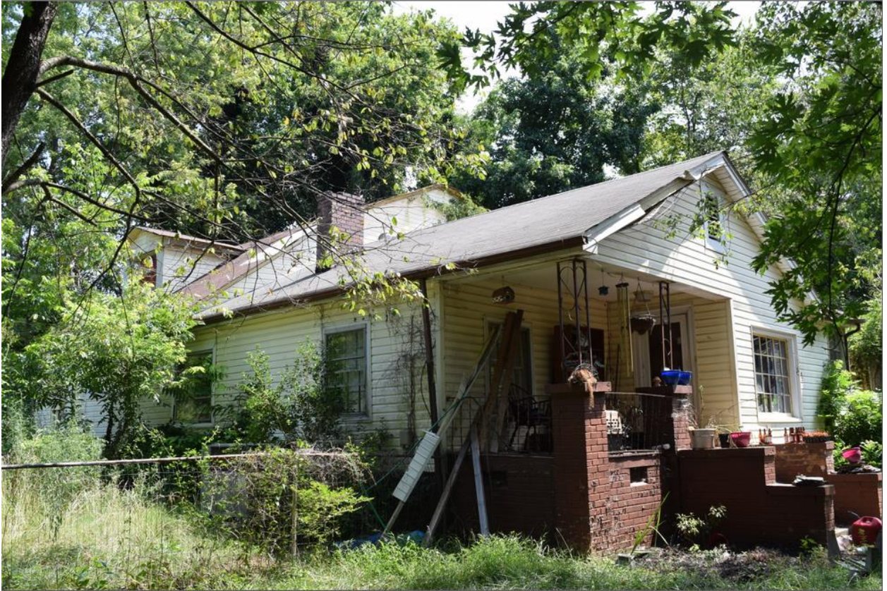
200 Rankin St